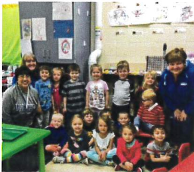
A kindergarten classroom at Rockford Elementary School in Rockford, IA with a newly installed radon pipe, part of Energy Association of Iowa Schools' School Radon Training & Support System program.

Radon testing and mitigation is important for the health of students and staff. It can even identify opportunities for energy efficiency and cost savings. For example, Energy Association of Iowa Schools provides a School Radon Training & Support System for Iowa schools. (Learn more about this program and how it has adapted during COVID-19 here .)